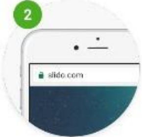
Go to slido.com