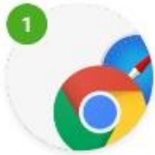
Open any browser